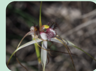
Caladenia longicauda subsp. borealis