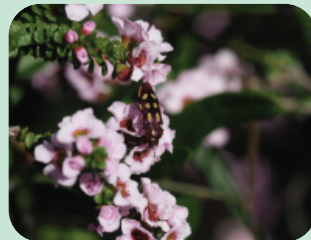
Scholtzia ciliata and Jewel beetle